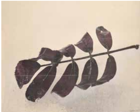
Phil Scorza, Orange City, Iowa Leaf 6 , 2020, pigment transfer and colored pencil on Arches paper, 22 x 30 inches