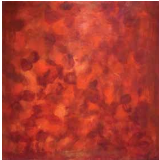
Lynnea Eggers, Sergeant Bluff, Iowa Field of Poppies , 2014, acrylic on canvas, 48 x 48 inches