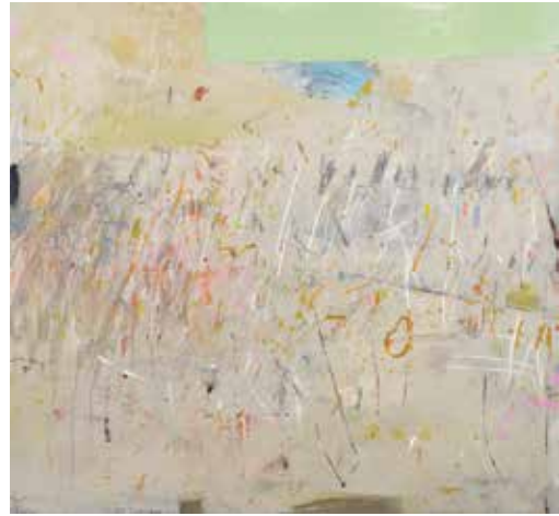
Rick Johns, Vermillion, South Dakota Ouroboros , 2020, acrylic, oil enamel, oil stick and drawing media on panel. 50 x 54 inches