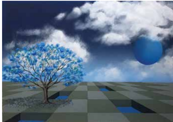
Mark Bowden, Sioux City, Iowa Blue Moon , 2020, acrylic on paper, 22 x 30 inches