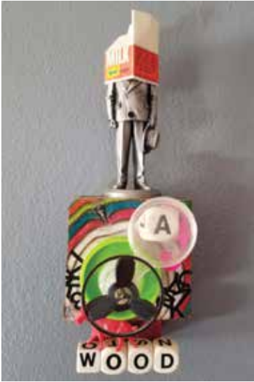
Jeremy Dumkrieger, Sioux City, Iowa Milk Does a Body Wood , 2015, found objects and mixed media, 10.5 x 3.5 x 4 inches