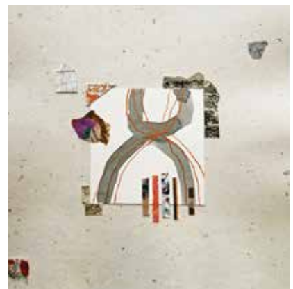
Patti Roberts-Pizzuto, Burbank, South Dakota Call and Response no. 15 , 2020, drawing and collage on handmade paper, 10 x 10 inches