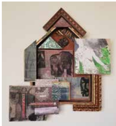
Johntimothy Pizzuto, Burbank, South Dakota The Meaning of Nonsense , 2019, mixed-media on wood and frame fragments, 18.5 x 16.75 x 2.75 inches