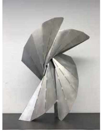
Steven T. Elliott, Wayne, Nebraska Gravitation No. 7 , 2016, stainless steel, 26 x 18 x 10 inches