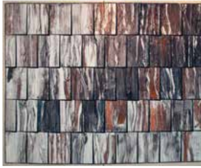
Joanne Alberda, Sioux Center, Iowa Tales from a Shingled Roof , 2018, hand-dyed cotton fabric: collaged and machine stitched, 50 x 61 inches