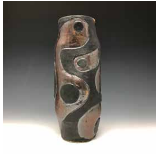
Annie Margie Laursen, Le Mars, Iowa Untitled, 2019, stoneware: wheel thrown and darter, stained and glazed, fired to cone 10, 9.5 x 4 x 4 inches