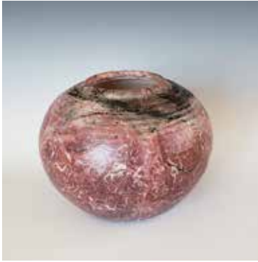
Diane Neri, Sioux City, Iowa Ferric Chloride Raku , 2014, raku pottery, 5 x 6.5 x 6.5 inches