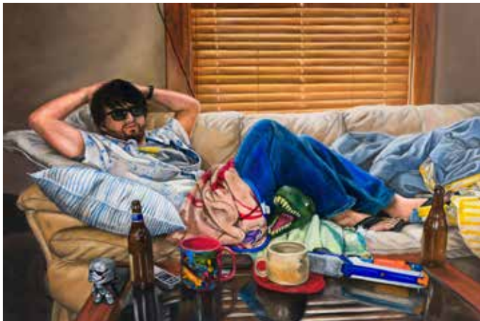
Klaire Lockheart, Vermillion, South Dakota L'Brodalisque , 2019, oil on canvas, 20 x 30 inches