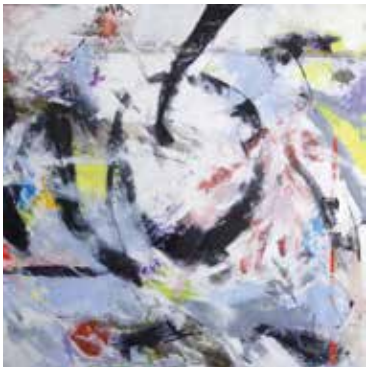
Cathy Palmer, Sioux City, Iowa Chop Mark , 2019, oil on aluminum panel, 36 x 36 inches