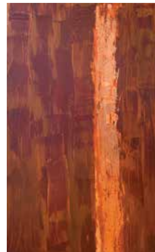
Amy Thompson, McCook Lake, South Dakota Road , 2019, mixed media, 48 x 24 inches