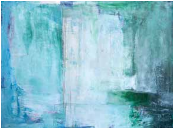
Sheryl Piere, Macy, Nebraska Big Reach , 2019, oil, cold wax, and graphite on panel, 36 x 48 inches