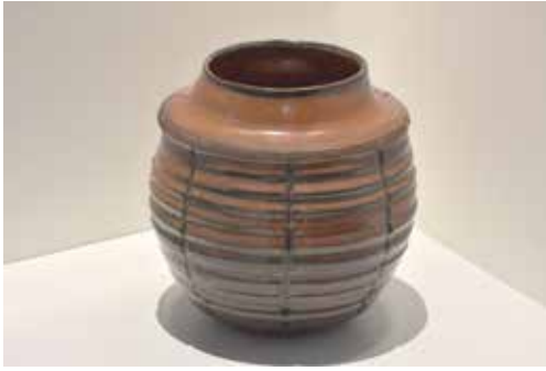
Paul Adamson, Sioux City, Iowa Dragon Fly Vase , 2012, stoneware: glazed with mountain red glaze, fired to cone 6, 8 x 7.5 x 7.5 inches