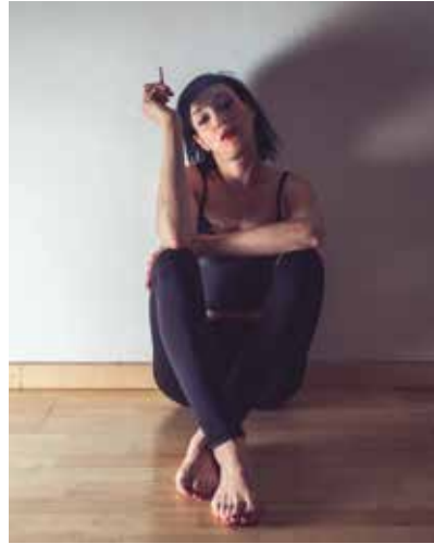
Michel Rohner, Sioux City, Iowa Dominatrix , 2018, photographic print on smooth matte hot press 100% cotton paper (330 gsm) with an extra smooth surface, 20 x 16 inches