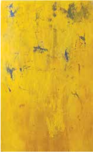
Austin Rodriguez, Sioux City, Iowa Moondance , 2019, acrylic on canvas, 36 x 24 inches