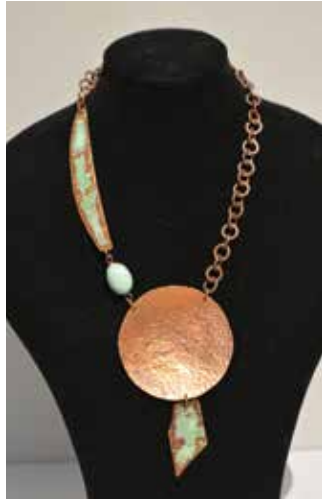
Susie Rodriguez, Sioux City, Iowa Necklace , 2019, hand-hammered copper pendant with turquoise stones, 20" necklace with 3" copper disc