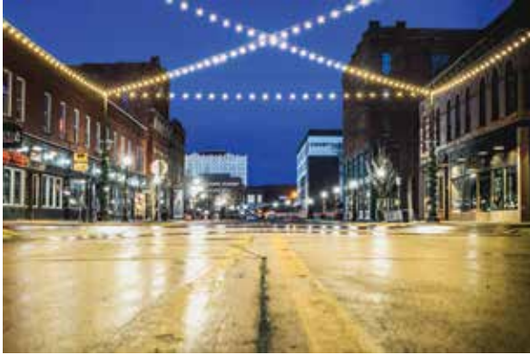
Britton Hacke, Sioux City, Iowa Rainy Morning on 4 th Street , 2020, photographic print, 16 x 20 inches