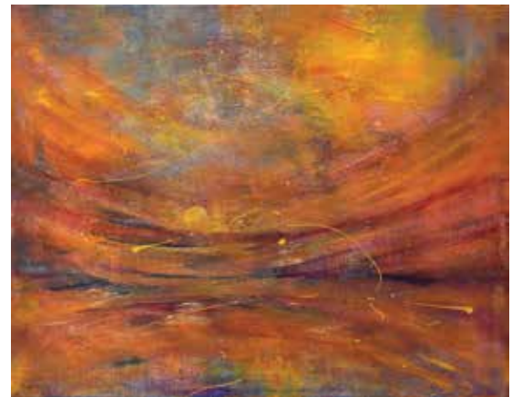
Chello Sherman, South Sioux City, Nebraska Sunset Lover , 2019, acrylic on canvas, 18 x 24 inches