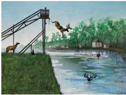
Henry Payer, Sioux City, Iowa The Diving Elk , 2020, mixed media and collage on canvas board, 16 x 20 inches