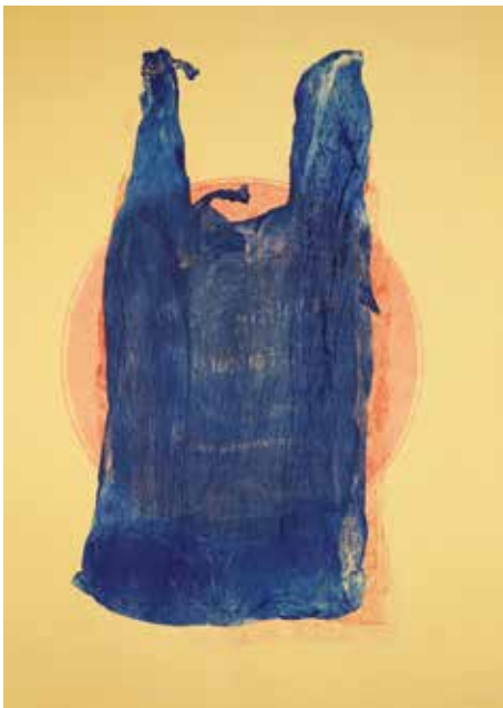
Hunter Bryan, Vermillion, South Dakota Detritus 018R , 2019, relief monotype, 24 x 18 inches