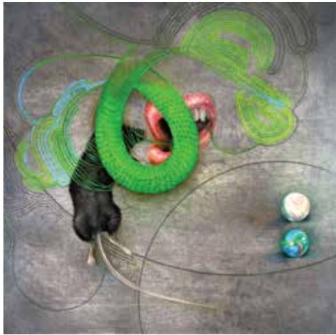
Francine Fox, Wayne, Nebraska Honey:Tar , 2010, varnished oil on cradled board, 8 x 8 inches