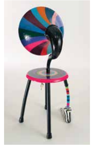
Shannon Sargent, Sioux City, Iowa The Whistleblower , 2020, mixed media on multiple materials, 36 x 21 x 19 inches