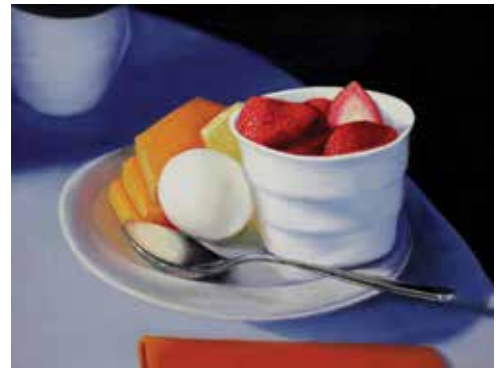
Denice Peters, Denison, Iowa Good Morning , 2019, pastels on paper, 12 x 16 inches