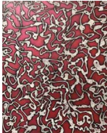
Thomas Kleber, Sioux City, Iowa Spaghetti Fever Dream , 2020, acrylic paint and paint pen on canvas, 30 x 24 inches