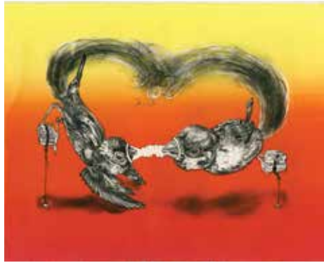
Meghan O'Connor, Sioux City, Iowa Gravitational Oscillations , 2018, lithograph and screenprint, 11 x 14 inches