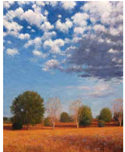
Gary Bowling, Cloud Play Too , 2018, oil on paper, 50 x 40 inches Courtesy Olson-Larsen Galleries, West Des Moines, Iowa; photo courtesy Gary Bowling

Join us for an always enjoyable reception, during which both artists and writers either speak about their work or conduct readings of the Review's poems and essays.