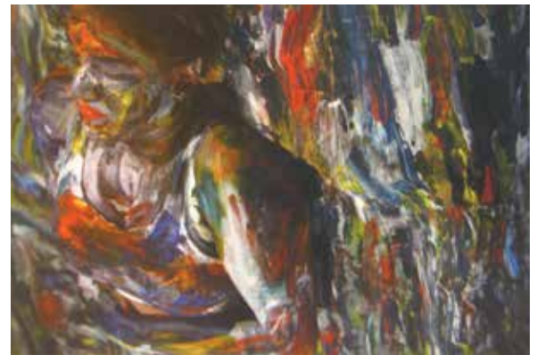
Sadie Martin, Invisible , 2015, photograph, 16 x 22 inches, courtesy of the artist photo Burg Studios

The exhibition includes artworks by local and regional artists who are featured in the 2016 edition of The Briar Cliff Review , Briar Cliff University's award-winning journal of articles, essays, poetry, photography, and art. The exhibition is an eclectic gathering of mediums and styles, presented as a sampling of many of the artistic trends occurring in the region.