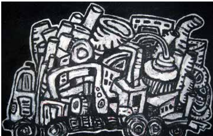
John Himmelfarb, Revelation , 2009, acrylic on canvas, 38 x 60 inches courtesy of the artist and Modern Arts Midtown, Omaha, NE