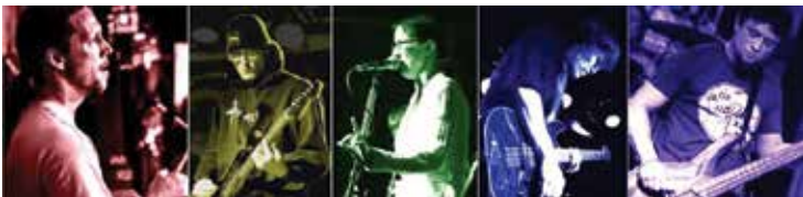
The Buddha Cheese Band