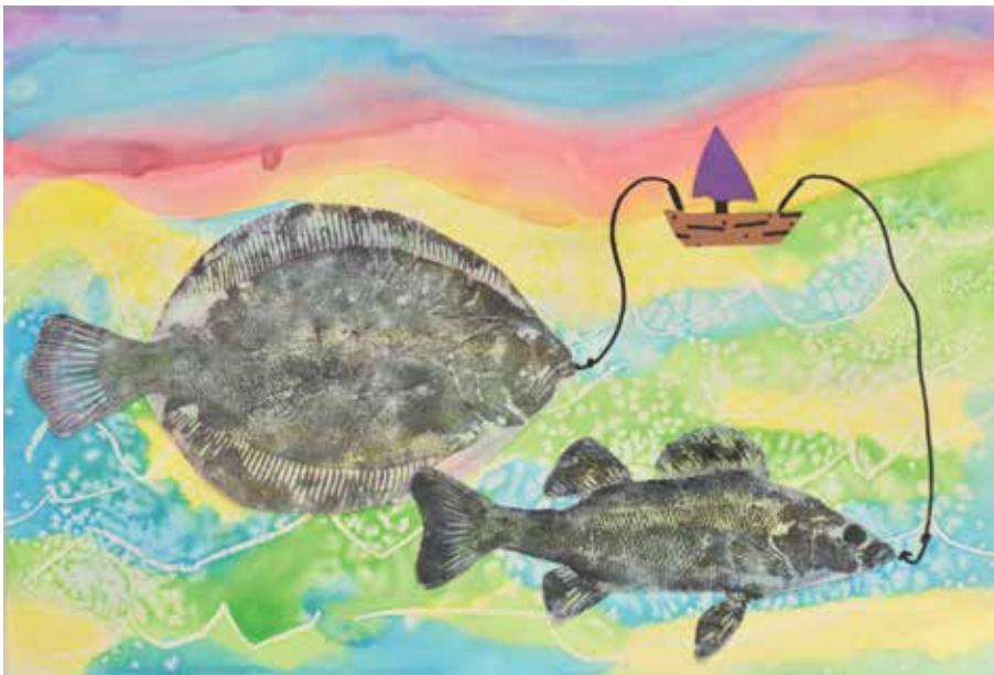
Maren Dreckman, A Good Day , Mixed media, Gehlen Catholic, First Place - Fifth Grade