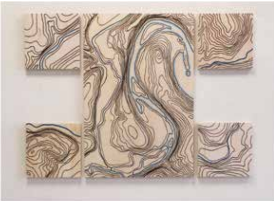
Kimberly Moss (Ames), Backbone Unearthed , 2019, Wood, watercolor, colored pencil, digital rendering, Backbone State Park