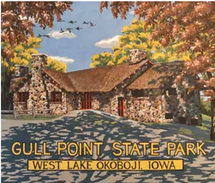
Paula Streeker (Ames), The Lodge , 2019, Acrylic paint on linen, Gull Point State Park