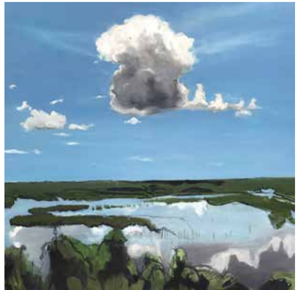
Barbara Walton (Ames), The Weight (I Wandered Lonely as a Cloud) , 2019, Oil on panel, Pikes Peak State Park