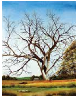
Last Stand , 2015, Watercolor