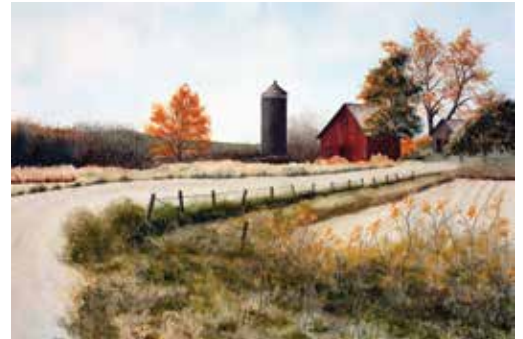
Gravel Path , 2020, Watercolor