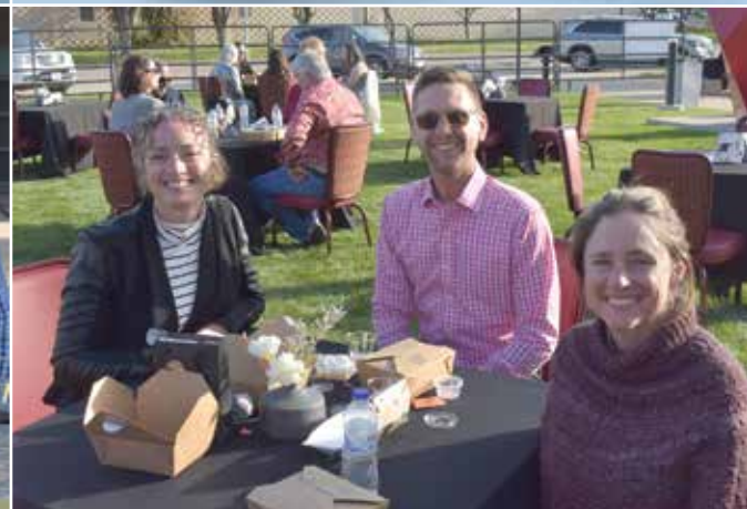
FLOWERS ON PARADE