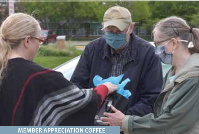
MEMBER APPRECIATION COFFEE