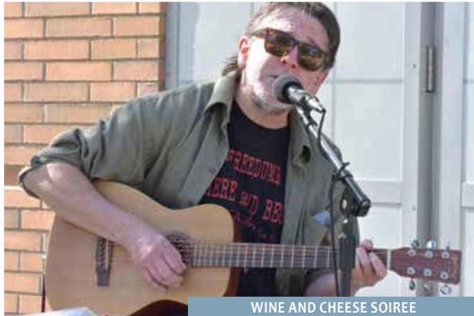
WINE AND CHEESE SOIREE