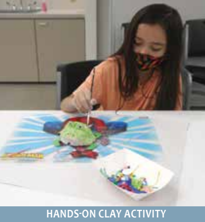
HANDS-ON CLAY ACTIVITY