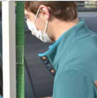
"COMET SHOWER" INSTALLATION