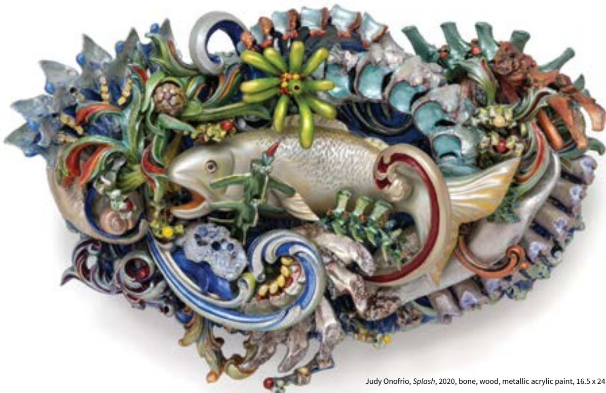
Judy Onofrio, Splash , 2020, bone, wood, metallic acrylic paint, 16.5 x 24 x 8 inches