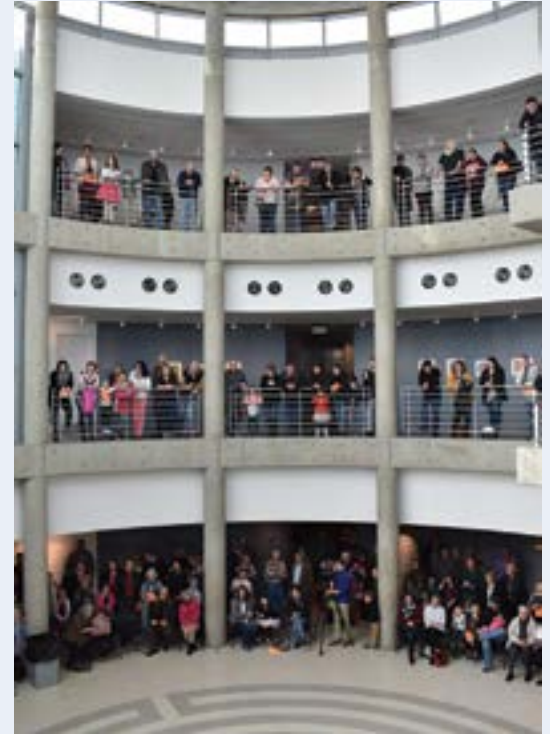
Patrons watching the award ceremony, from the atrium, during the opening reception for Youth Art Month Exhibition